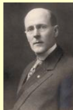
RI Founder Paul Harris