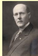
RI Founder Paul Harris