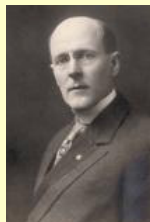
RI Founder Paul Harris