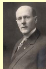
RI Founder Paul Harris