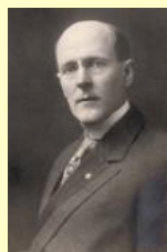
RI Founder Paul Harris