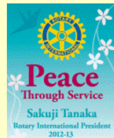
RI theme 2012-13