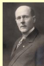
RI Founder Paul Harris