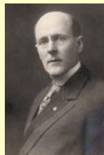
RI Founder Paul Harris