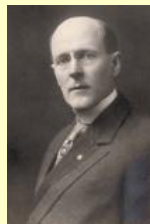
RI Founder Paul Harris