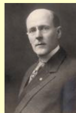
RI Founder Paul Harris