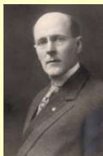
RI Founder Paul Harris