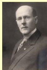
RI Founder Paul Harris