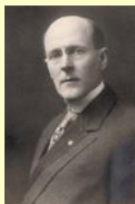
RI Founder Paul Harris