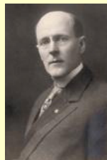
RI Founder Paul Harris

After a busy year it is time relax and to celebrate Christmas with friends and family and I look forward to our Rotary Christmas Celebration at Woodlands Golf Club on Tuesday. I hope to catch up with many of you and your partners on the night.