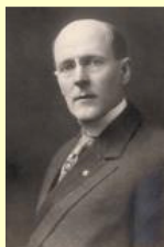
RI Founder Paul Harris