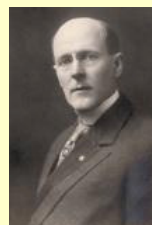
RI Founder Paul Harris