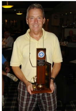
Le Pines won the trophy