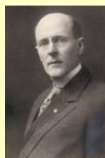
RI Founder Paul Harris