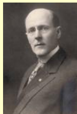
RI Founder Paul Harris