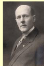
RI Founder Paul Harris