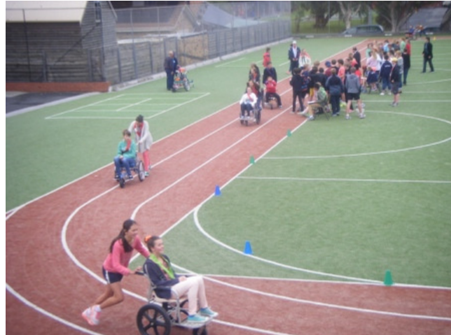
Wheelchairs on the run