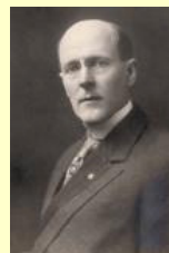
RI Founder Paul Harris