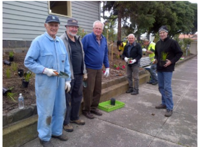
The Tree Planters at Parkdale Railway Station 27 October 2012