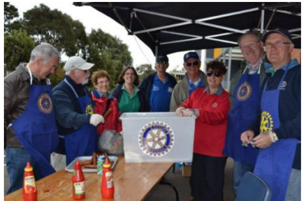
Rotary sausage sizzlers