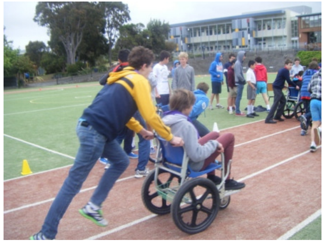
Fierce competition between the teams