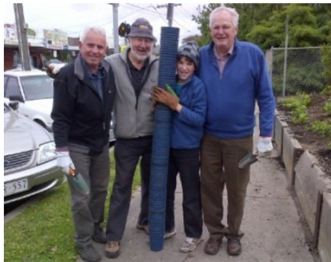
More tree planters