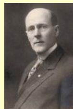
RI Founder Paul Harris