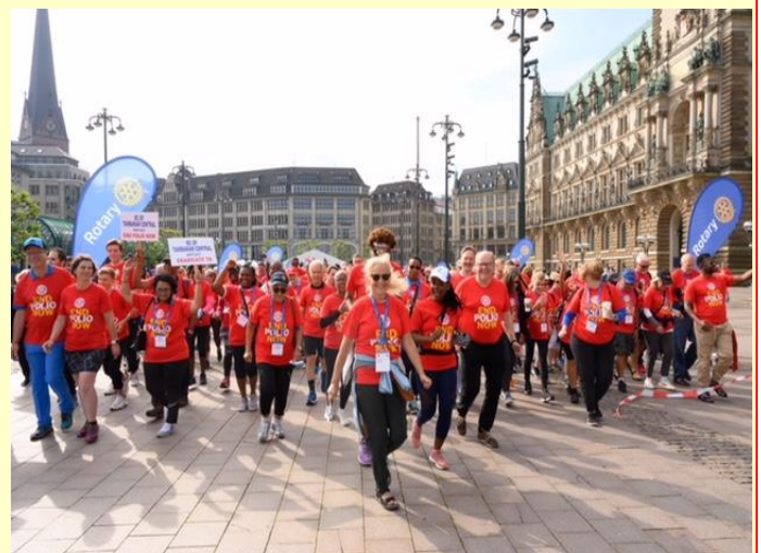
"End Polio Walk" For more photos, go to: www.riconvention.org/en/hamburg