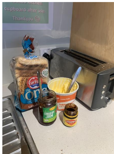
Back at Yarrabah after the holidays making breakfast for the hungry students.