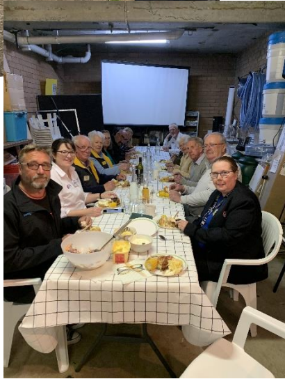
A most enjoyable and informative visit to Disaster Aid Australia located in Eumemmerring.