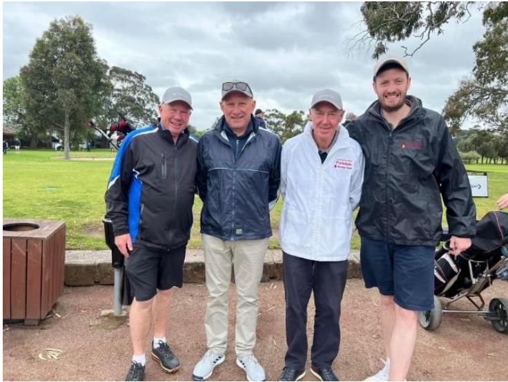
Another great Golf Day under our belt!! a cold day but the rain held off - many thanks to Ernie, Trevor and their many helpers on the day!!