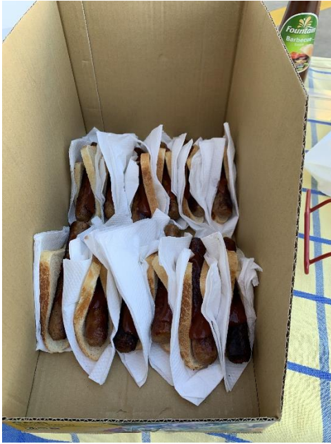
Our biggest order ever - 12 sausages to go!!