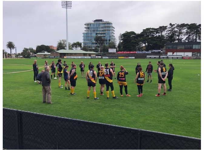
RECLINK BBQ CELEBRATING THE START OF THEIR SEASON