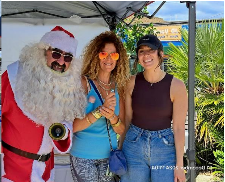
SANTA MADE A SUPRISE VISIT- COMPLETE WITH HIS TWO-TONED BEARD!!