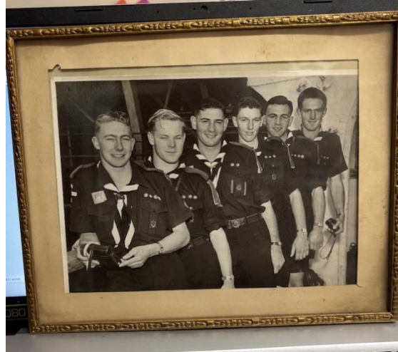
CAN PICK JACK OUT??