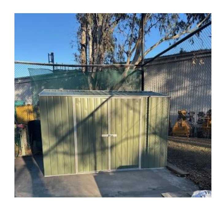
SHED AND RAMP NOW INSTALLED AT THE SALVATION ARMY COMMUNITY GARDEN – THANKS TO ALL INVOLVED!!