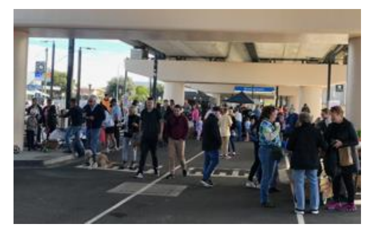
CELEBRATING THE END OF THE RAIL WORK AT PARKDALE RAILWAY STATION