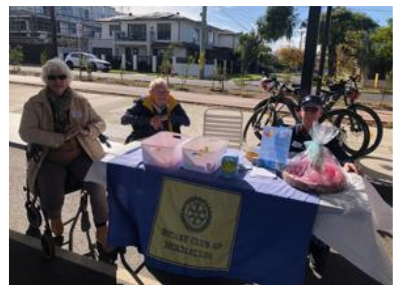
GREAT TEAM EFFORT THANKS EVERYONE!!