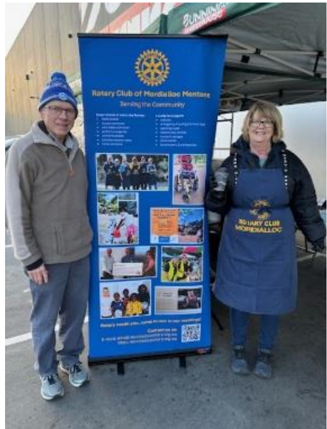
OUR NEW BANNER DISPLAYED AT OUR LATEST SAUSAGE SIZZLE