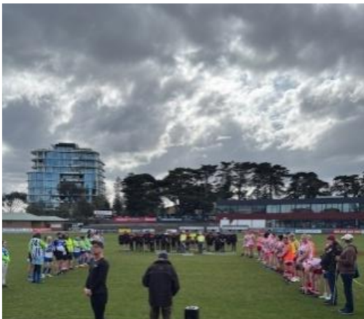
LET THE GAMES BEGIN – 3 FINALS OVER THE DAY