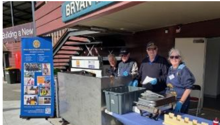
TEAM RECLINK FEEDING THE MASSES COOKED 597 SAUSAGES