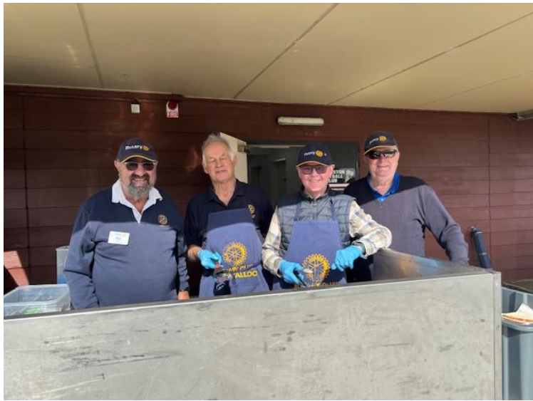
THE BOYZ HAVE MY HANDS FULL KEEPING HIS LOT IN ORDER!!