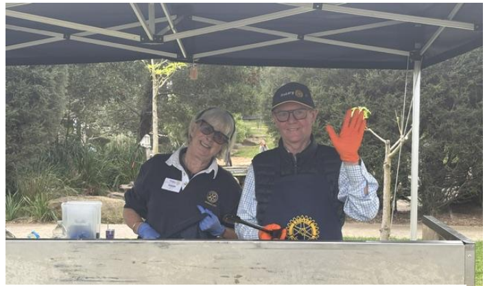
ANOTHER GREAT DAY AT THE ROYAL CHILDREN'S HOSPITAL FAMILY BBQ